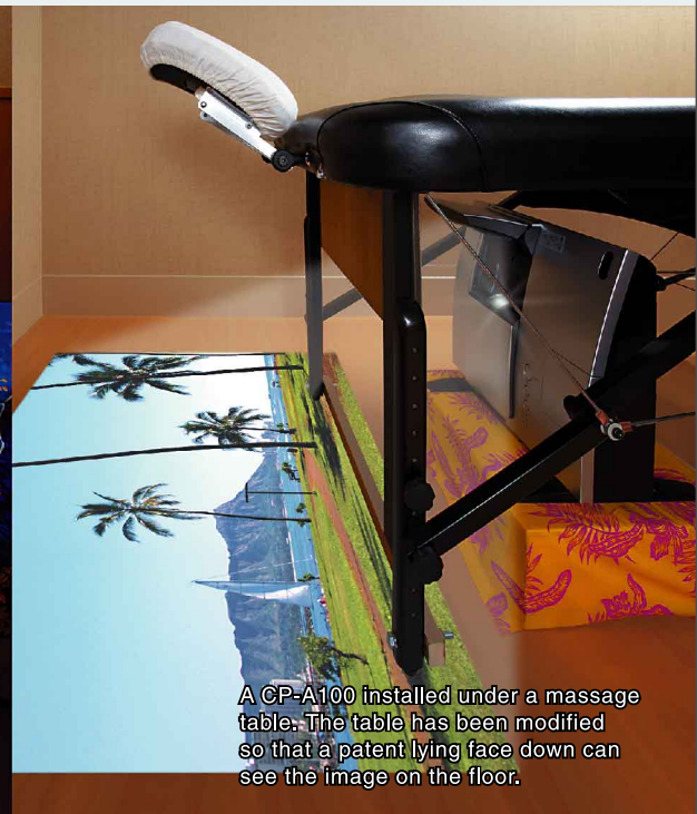
A CP-A100 installed under a massage table. The table has been modified so that a patient lying face down can see the image on the floor.

• Photos are simulated images for explanation purposes.